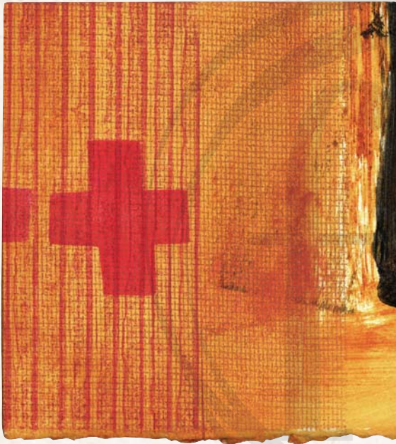
Crossed, 2008, 38 pages, 5 1/2" x 5 1/2" (13cm x 15cm)