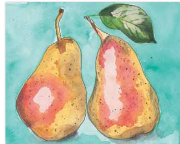
SKETCHED PEARS (PEAR 2)