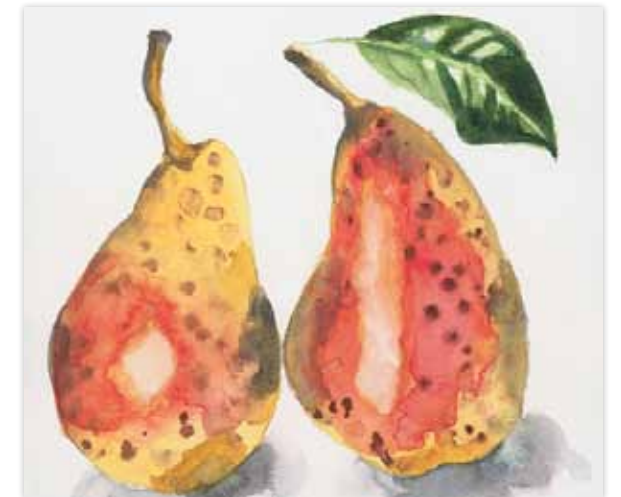
LOOSE PEARS (PEAR 3)